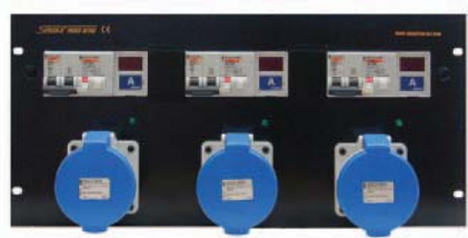
3 x 32Amp RKP32PRM3S