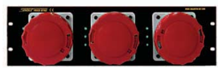
3 x 63Amp RKP63PR3TU3