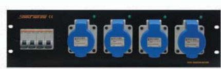
4 x 16Amp RKP16PR4