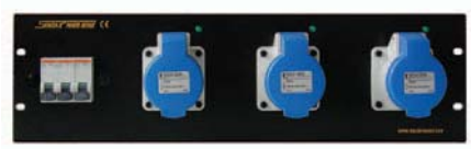
3 x 16Amp RKP16PR3